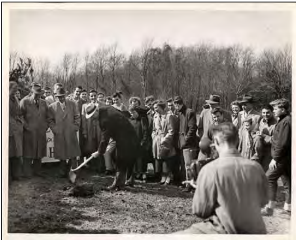
The 1952 groundbreaking for Erie Hall.