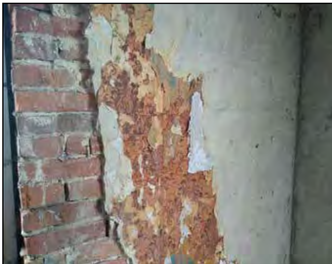
Many layers of wallpaper in the Federal House in 2019 before the current renovation.